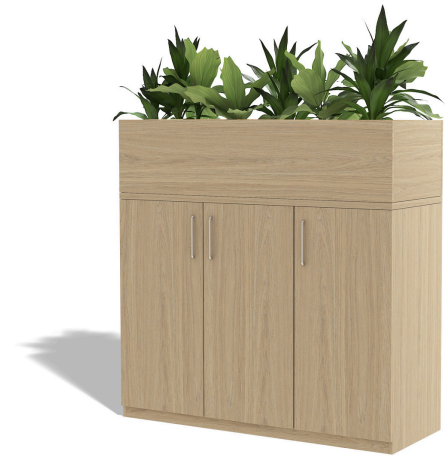
PLE-2 Dim overall: 1200mm W x 450mm D H: 1200mm