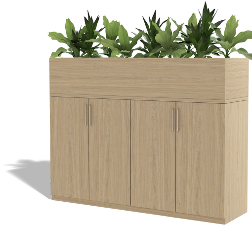
PLE-3 Dim overall: 1600mm W x 450mm D H: 1200mm