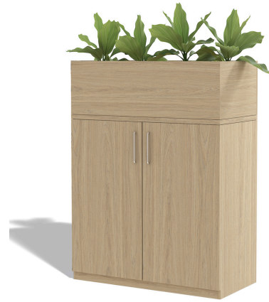
PLE-1 Dim overall: 900mm W x 450mm D H: 1200mm